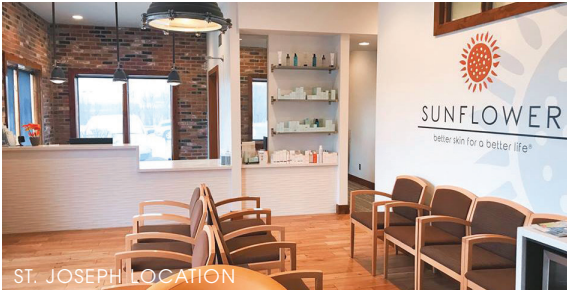
ST. JOSEPH LOCATION